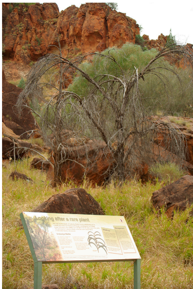
Fig. 1. The Undoolya Wattle Acacia undoolyana , nationally listed as vulnerable, standing dead in a sea of invasive pasture grasses (largely buffelgrass Pennisetum ciliare ). This species occurs in several small populations in a 165-km 2 area of the East McDonnell Ranges in central Australia. Fires in 2013 killed many of the trees in the N'Dahla Gorge population (pictured). Although the wattle is threatened by hot fires, the dominant role that buffelgrass plays in altering the fire regime is not mentioned on the information board. Introduced pasture grasses are contentious in the Australian rangelands because they are used by the cattle industry, but also are highly invasive, fueling intense fires that kill woody plants and transform ecosystems.

Here, we take a global perspective to consider whether new pasture taxa are likely to become environmental weeds (hereafter “environmental weed risk”) and whether there are mechanisms in place to limit potential risks. Although we focus specifically on the risk of new pasture taxa becoming environmental weeds, we acknowledge that very similar risks, and likely solutions, apply to other systems of production including bio-energy (18, 19), carbon sequestration (20), forestry (21), and horticulture (21, 22). We find that increased environmental weed risk from new pasture taxa presents a major challenge to increasing livestock production in a way that is consistent with SI (5). Nevertheless, there are practical solutions to reduce these risks that can be informed by new research and extend from government regulation to responsible product development and consumer choice (Fig. 2).